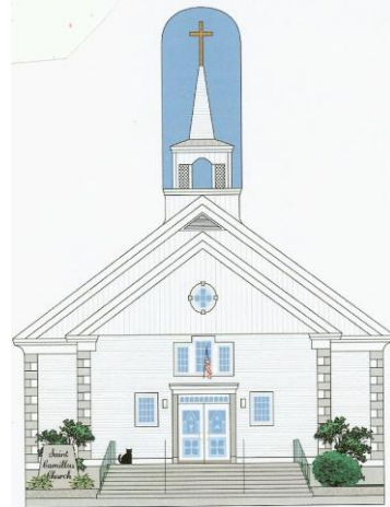
St. Camillus Church